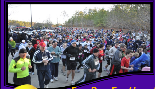
Fun Run For Hope!