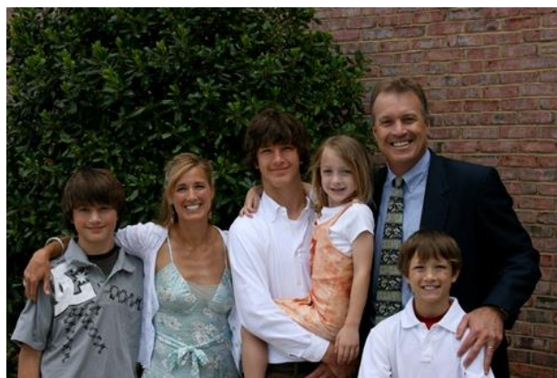
The Trautwein Family, April 2010