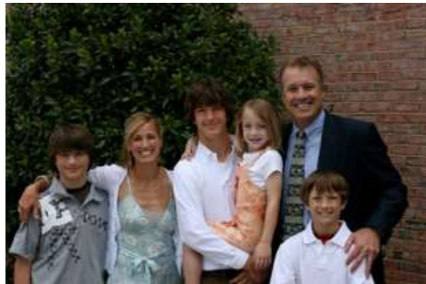
The Trautwein Family, April 2010